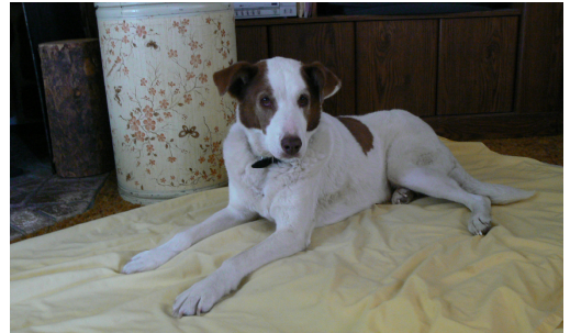
Fourteen-year-old terrier, Annie

clinics sponsored by Helena Friends of Pets (HAFoP), Pad for Paws helps many financially stressed owners get the medical care that their pets need.