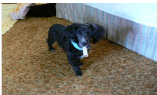
Toby the Yorkie/Poodle

If you would like to join the effort of alleviating the suffering and enhancing the lives of domestic animals in our community, please contact us, or visit padforpaws.org